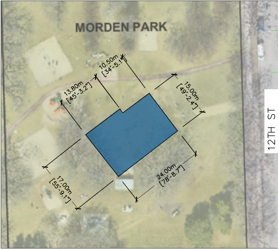
SPRAY PARK PLAN NTS